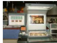
Installed on Komori Console

The MMP-KVS is a specially designed add-on to GTI's Komori viewing system that provides full and variable intensity lighting plus a full-motion LCD monitor arm and hood for effective comparison of press sheet to soft-proof.