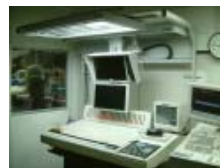
Installed on Goss Console