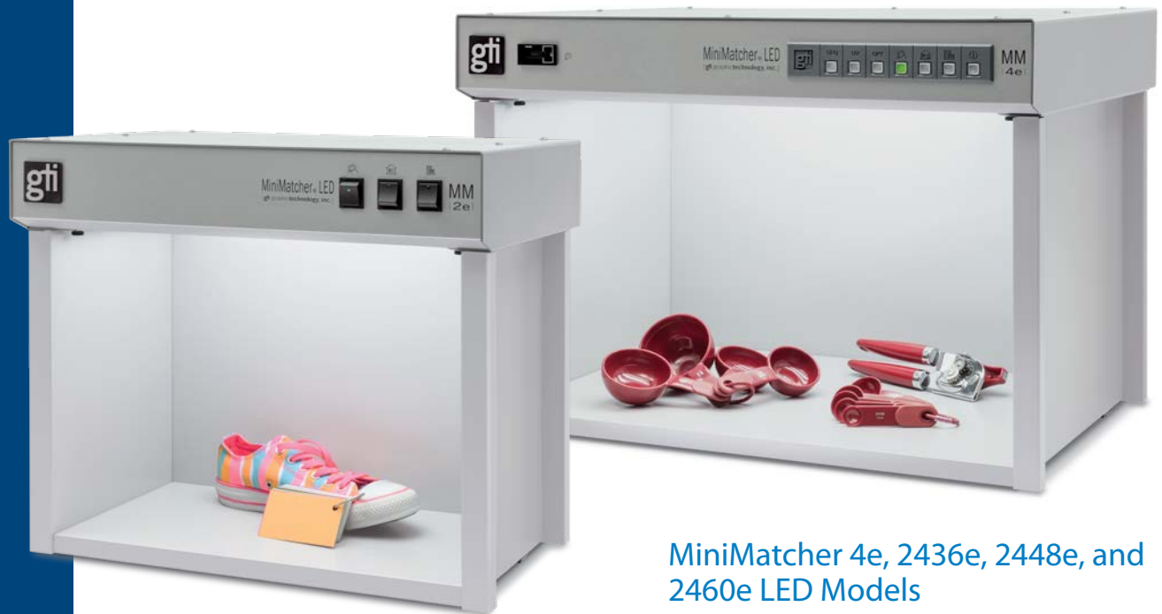
MiniMatcher MM-2e/LED (left) and MM-4e/LED (right)

Affordable Tabletop LED Color Matching and Inspection Systems